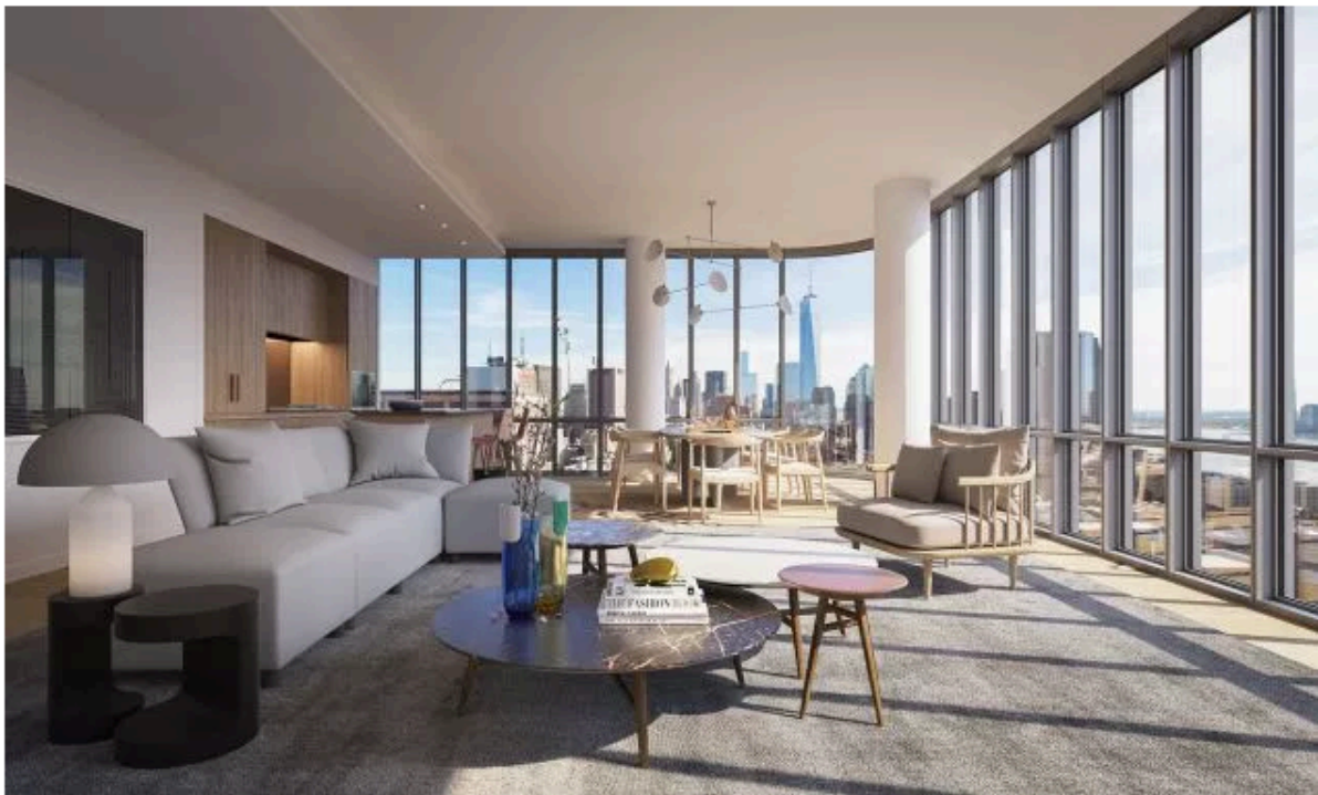
An airy layout and floor-to-ceiling windows. 565 Broome Soho

As the warm, hazy days of summer become a distant memory and crisp autumn air sets in, those looking at higher end homes in the city right now are attracted to apartments that fit into a fashionable aesthetic. Though interior design and architecture trends don't change at quite the speed of the fashion realm, certain styles and layouts are sparking the interest of knowledgeable buyers. "Unlike the past, today's New Yorker knows what good design is and what it can do for them," Charlie Kaplan, a principal at GLUCK+, the design firm behind 150 Rivington, told the Observer. "They want spaces that integrate rich finishes, big light and air, unique detailing and practical floor plans into a beautiful coherent whole." That move toward open layouts remains in-demand, particularly with sleek new developments downtown. At 565 Broome Soho, where a three-bedroom duplex is currently listed for $14 million, interior design firm RDAI intentionally created open, airy spaces that blend the rooms.