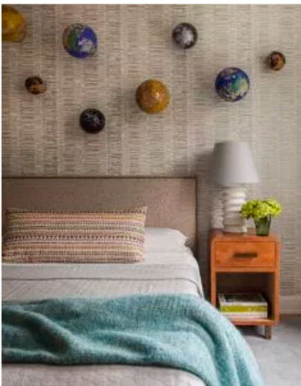
Attention to detail and mixing fabrics at the Shephard in the West Village.

Eisen opined, “but also because of a fire’s crackle and aroma, which have the unique ability to mentally transport you to a mountain chalet, creating a warm and toasty escape from the chill of a concrete jungle.” According to James Huniford of Huniford design studios, a big trend to watch out for this fall is a meticulous attention to detail in unexpected rooms in the home—including the bathroom. “Because bathrooms are small spaces they are an easy place to experiment with color as well as unexpected art without committing to it in a large room,” Huniford explained.