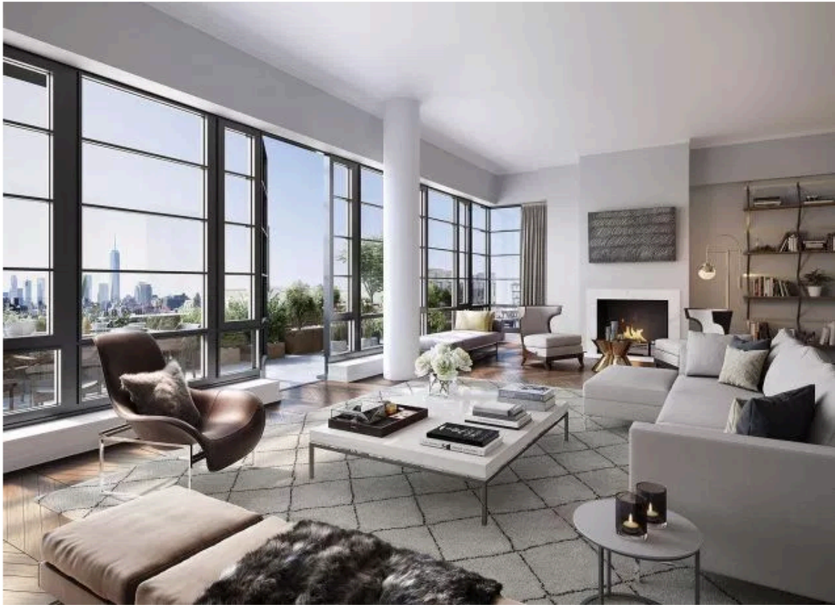
Luxurious interiors at the d'Orsay in the Meatpacking District. D'Orsay

Garcia notes that buyers will be attracted to the European flavor “mixed with understated and ageless elegance. The language is conveyed through a wide palette of finishes and materials that exude elegance and luxury, from bronze to venetian plaster walls, textured wooden panels, custom lighting and velvet furniture with my signature color red.” Ah, yes—a Bordeaux-colored velvet and a fireplace do seem the perfect antidote to the impending winter days.