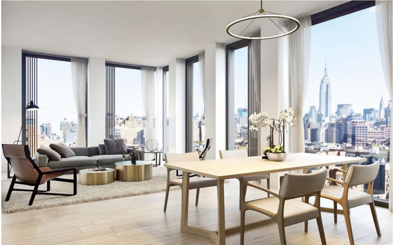
Spacious living room at 100 Barrow, complete with expansive windows and white oak flooring.

Situated in the West Village , the units join 135 other residences for sale in the neighborhood, with condos at a median price of $4.5 million ($2,828 per square foot), and co-ops at a median price of $1.395 million ($2,000 per square foot). The average closing price for a condo in the neighborhood this October was $2,392 per square foot, down slightly from last October's average condo closing price of $2,495 per square foot. For co-ops in the neighborhood, the average October closing price was $1,647 per square foot this year, down from last October's average co-op closing price of $1,964 per square foot.