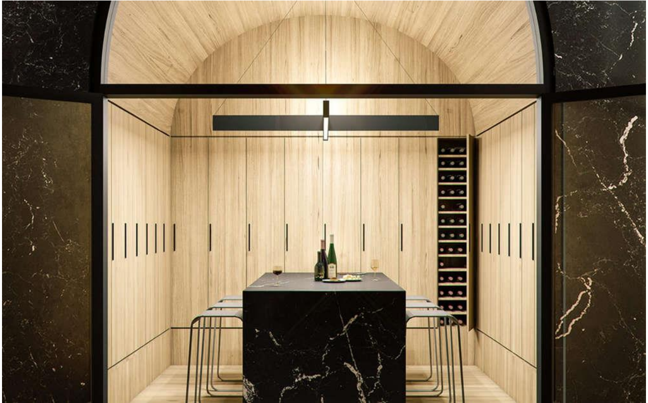
100 Barrow offers a vaulted wine cellar and tasting room with dedicated cellar racks and black marble table.