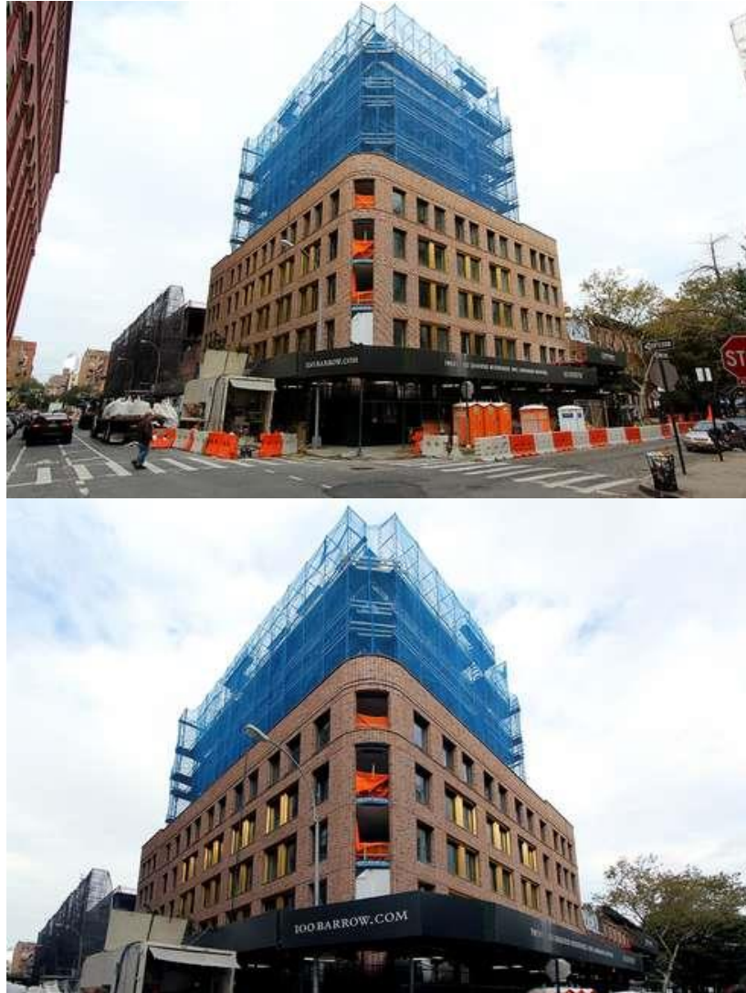
100 Barrow Street under construction

Inside 100 Barrow, residences are designed by Bernheimer Architecture to feature wide-plank white oak floors, oil-rubbed satin bronze entry doors, and grey marble walls. Kitchens and baths will be complete with custom designed Bernheimer fixtures as well. The building's amenity package will include a wine cellar and tasting room, a lounge, a fitness center, a sauna, a steam room, an entertaining kitchen, a children's playroom, a bike room, and a pet spa. Though not equipped with its own private garden as is the Shephard, 100 Barrow offers residents beautiful views of the neighboring cloister gardens.