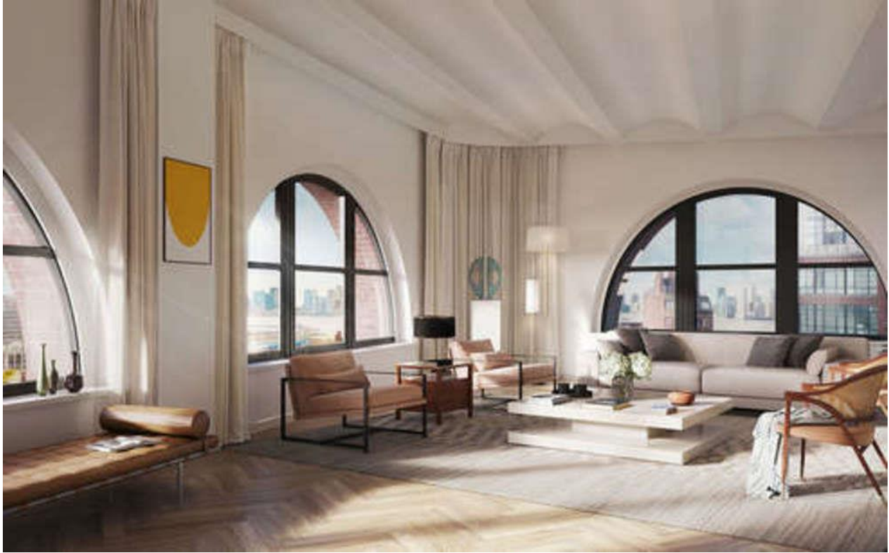
Residences at the Shephard host unique vaulted ceilings and solid oak flooring.

At 100 Barrow Street , the new ground-up development by Toll Brothers is nearing the finish line, and replaces a former parking lot on the corner of Greenwich and Barrow Streets. Designed by Barry Rice Architects , the building features a traditional Flemish bond brick pattern designed to reflect the neighboring townhouses and church. A six-story setback allows for a contemporary presence on the historic landscape. Current co-op availabilities at 100 Barrow include 2-bedrooms starting from $4,667,990, 3-bedrooms starting from $6,224,990, and a 4-bedroom unit priced at $11,809,990. Aside from the 26 residences on the upper level floors, the building will also host 7 affordable units on the first two floors, ranging from studios to 2-bedroom units.